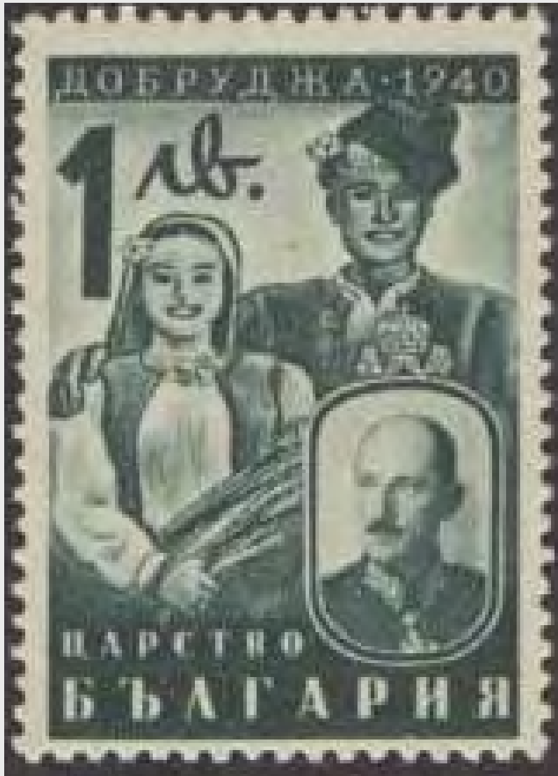
Bulgarian Peasant Couple and Tsar Boris