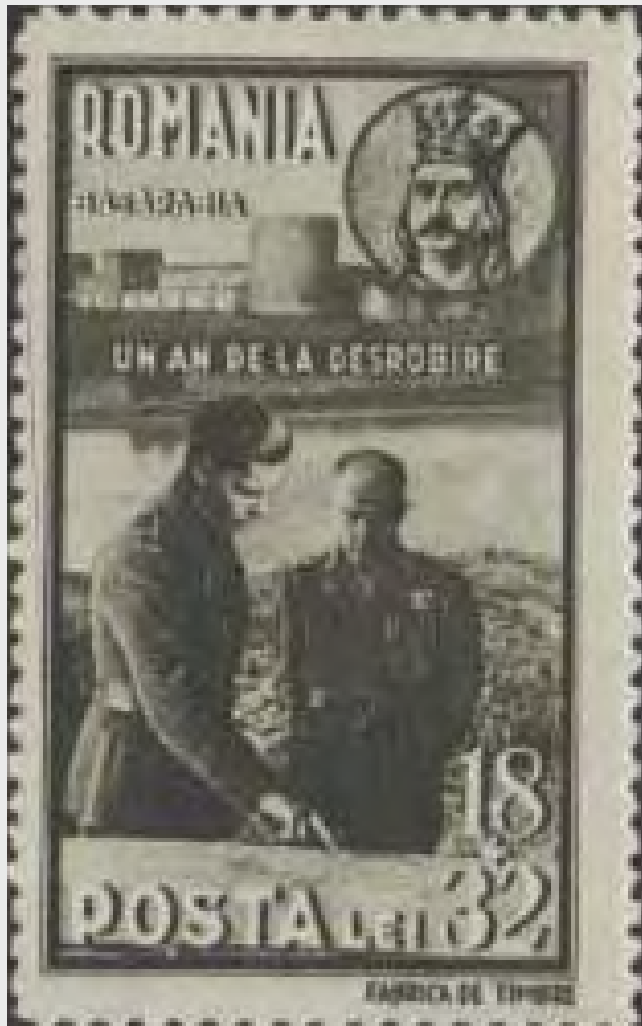
King Michael, Marshall Antonescu, and Stephen of Moldavia