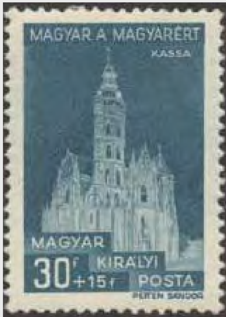
Kassa (Slovakia): Cathedral