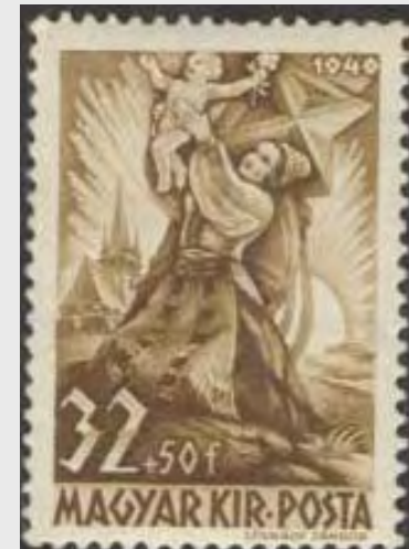
Madonna and Martyr