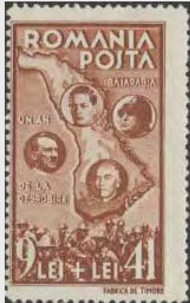
Map of Bessarabia plus King Michael, Marshall Antonescu, and Friends