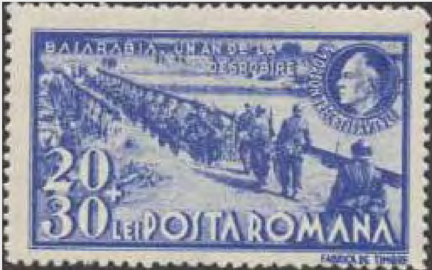
Romanian Troops crossing the Pruth River to retake Bessarabia, Marshall Antonescu