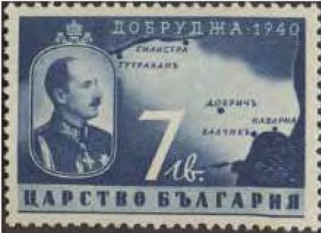
Tsar Boris and Map of Dobrudja