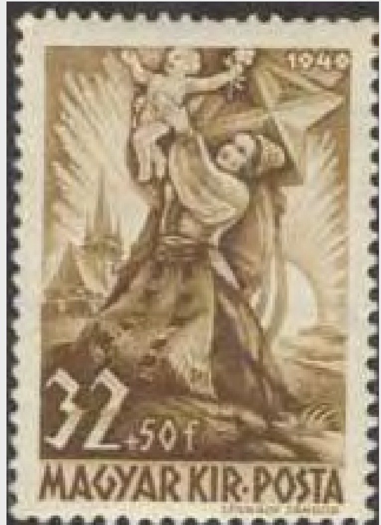
Mother offering Child to the Fatherland