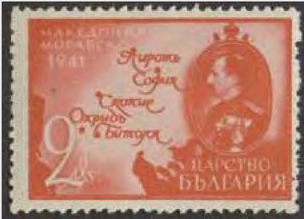
Map of Macedonia with Miniature of Tsar Boris