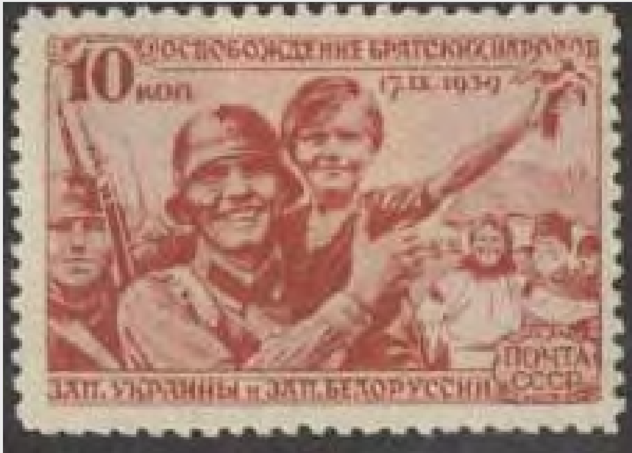
Villagers Welcoming Red Army Soldiers