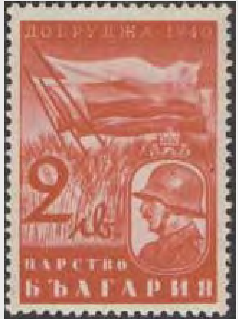
Bulgarian Flags over Field of Wheat, Tsar Boris