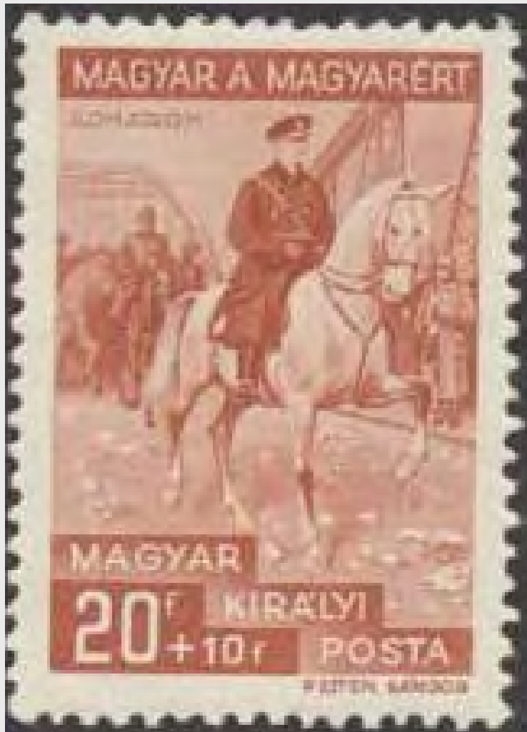
Admiral Horthy leading Troops into Komaron