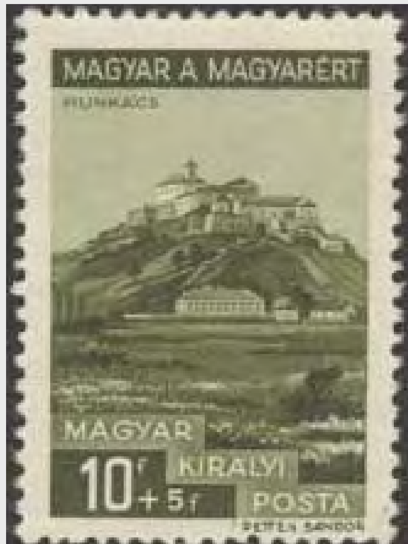
Munkacs (Sub-Carpathian Ruthenia): Fort