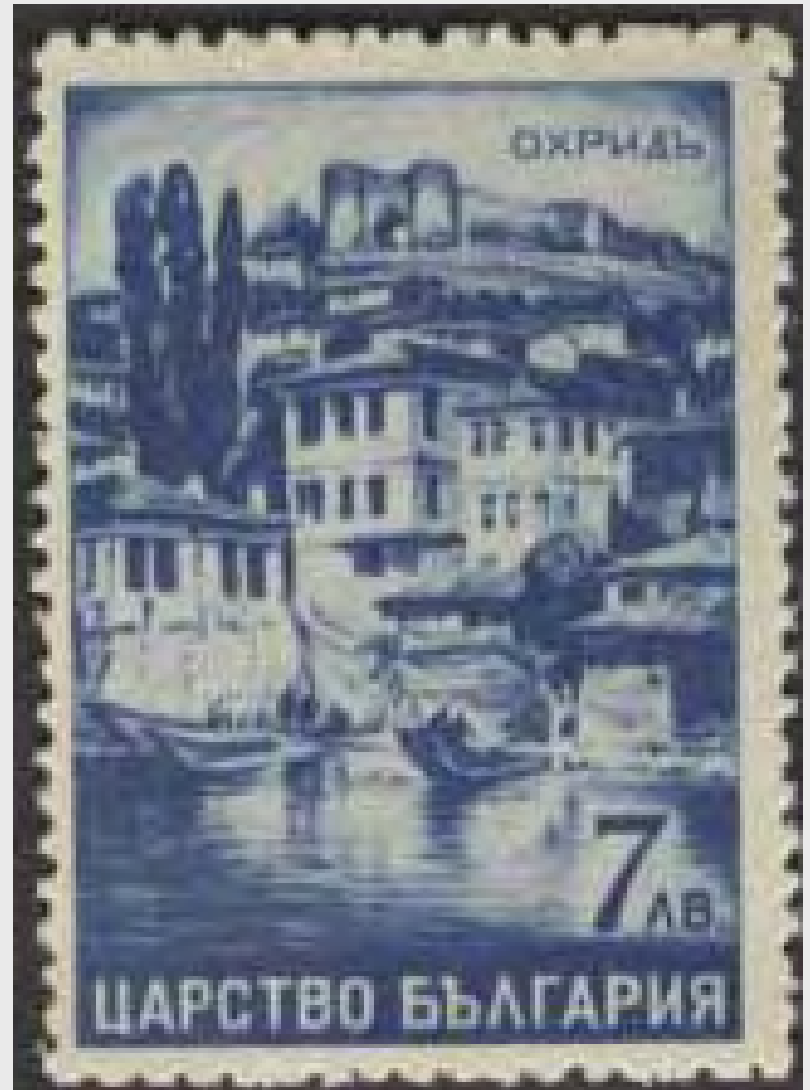
City of Ohrid (Macedonia)