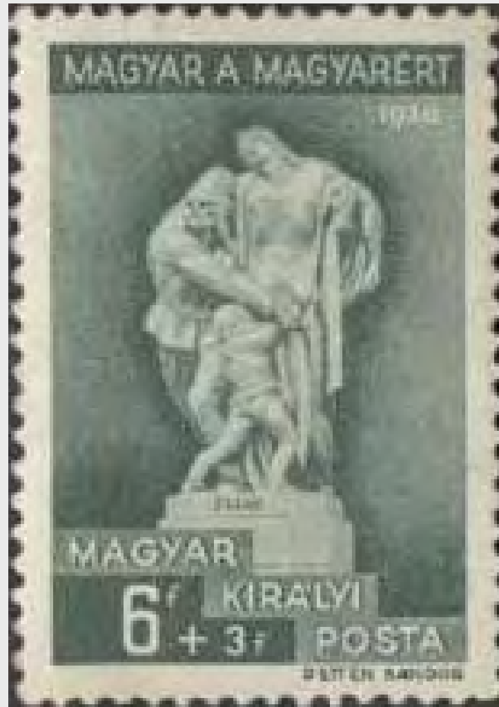
Statue representing Northern Territories