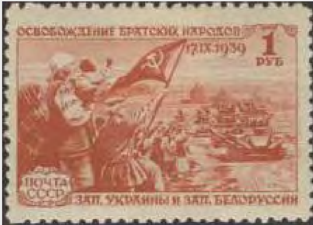
Crowd Waving to Tank Column