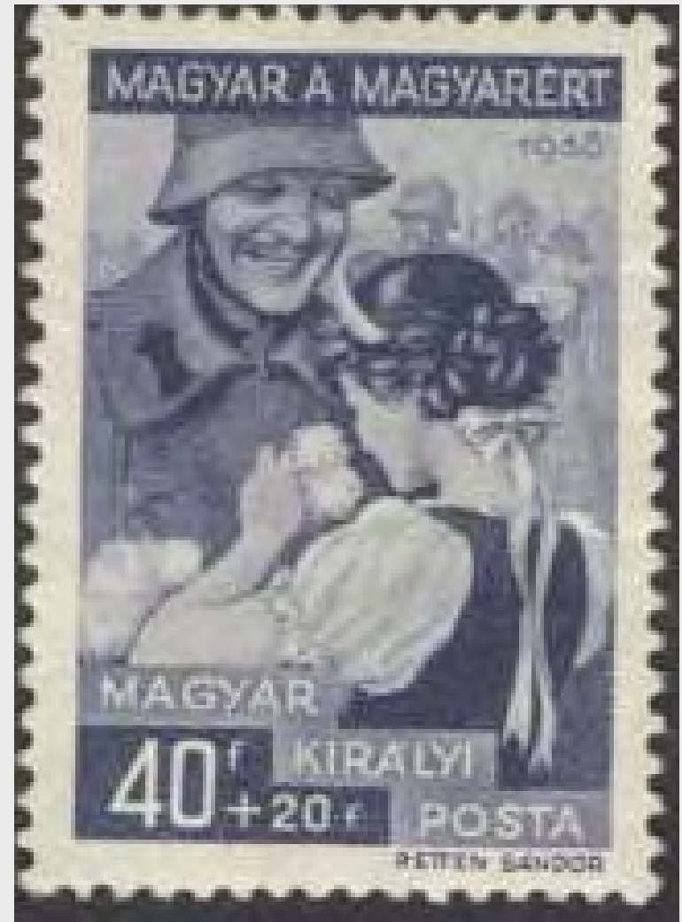
Hungarian Girls offering Flowers to Hungarian Soldiers