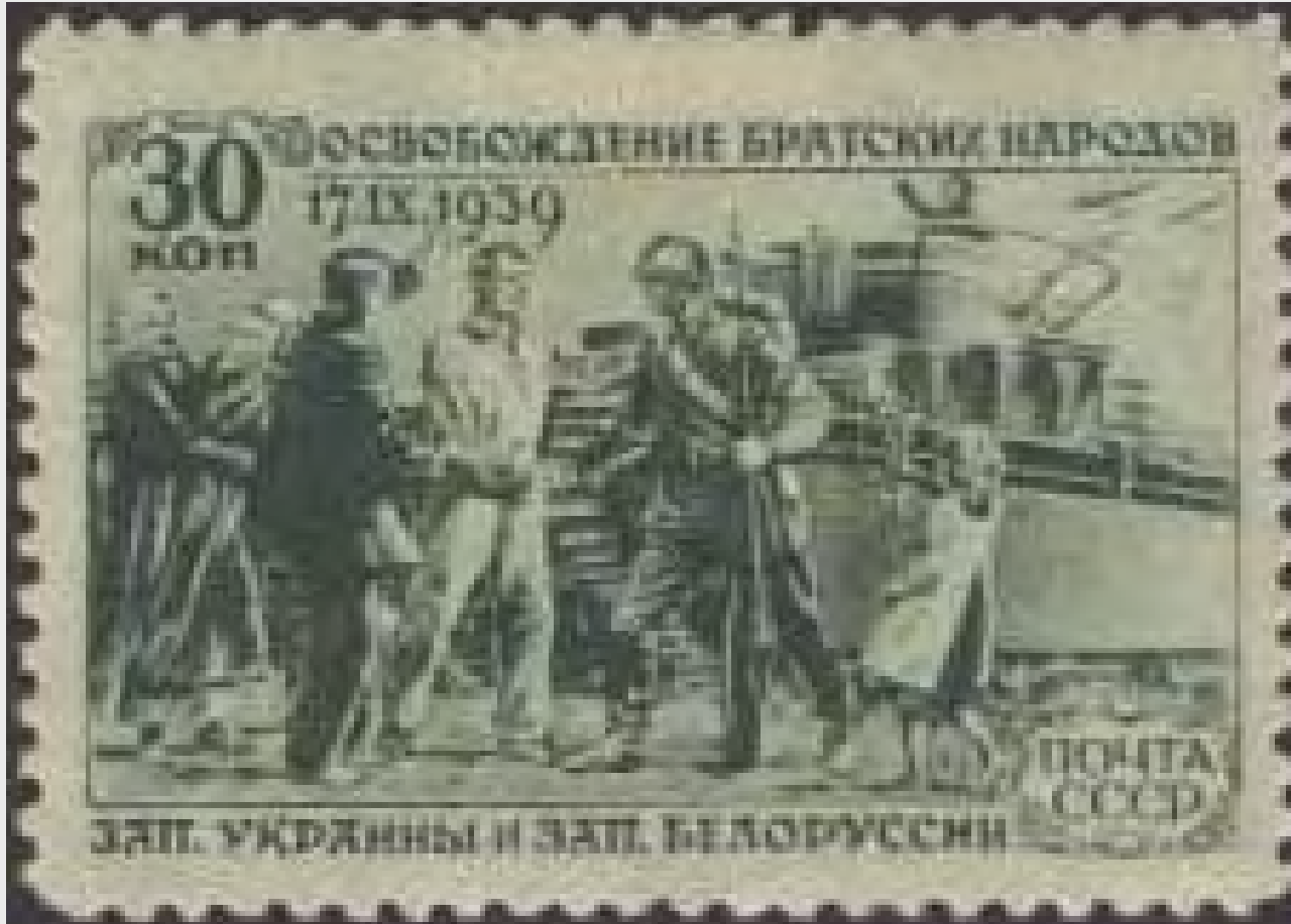
Villagers Welcoming Tank Crew