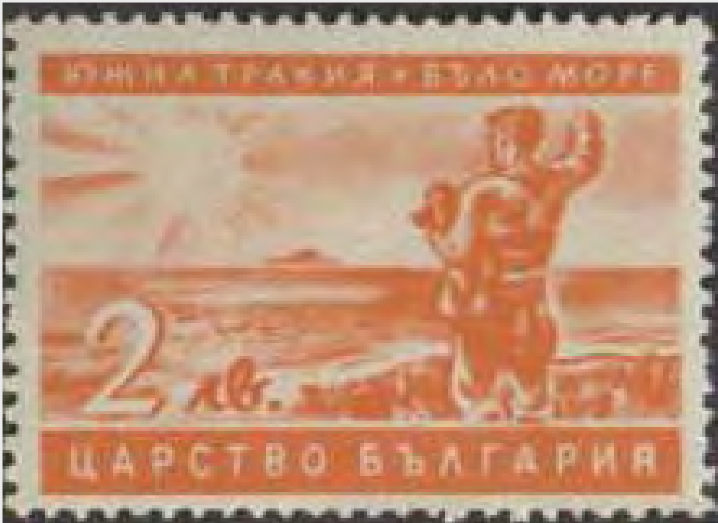
Southern Thrace: View of the Aegean Sea and the Island of Thasos