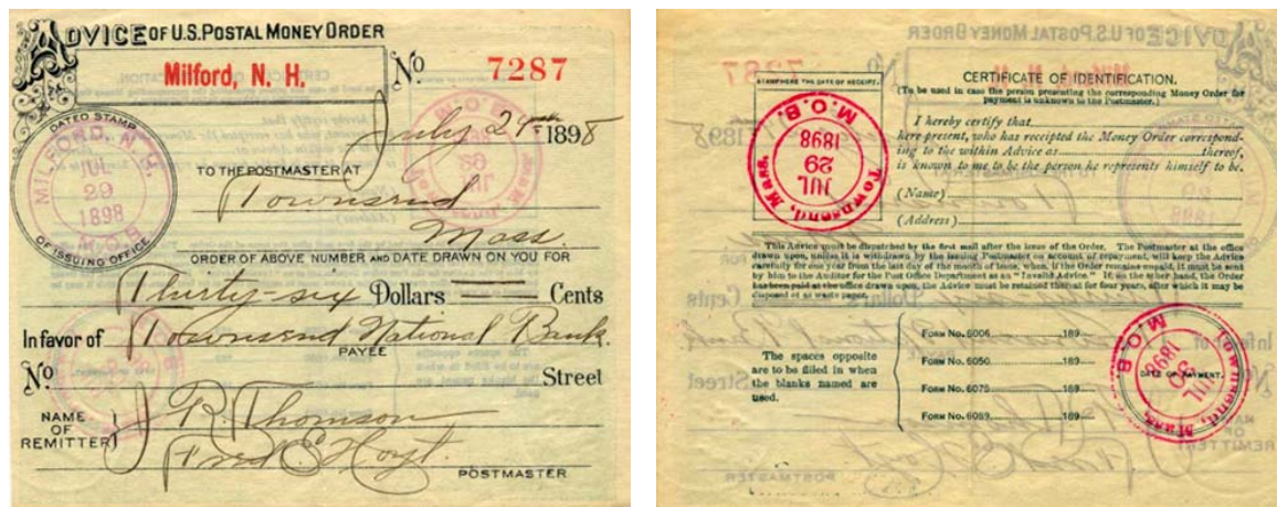
Figure 1. Front and reverse of money order advice form.

The illustrated advice form shows the operation of this system. The front shows that a money order for $36 was purchased in Milford, NH on July 29, 1898. It was payable to the Townsend National Bank of Townsend, Massachusetts. The date stamps on the reverse show that the advice form was received in Townsend on July 29 and the order was paid there the next day, July 30.